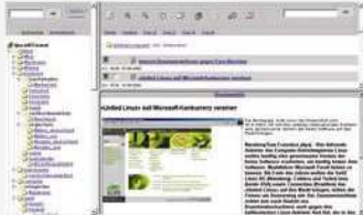
-Overview CMS- On the left the directories-tree, on the right above the content of a single folder, below the detailed view of a message.