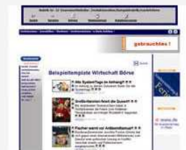
Browse to your website and edit "on-the-fly"!