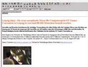
-WYSIWYG-editor "Direct Edit"- Edit your story and/or layout the easy way right on the desk.