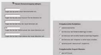
-Screenshots user administration- Decide, which users are accessible for others. Set rights individual and/or for functional groups.