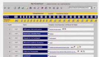
-Template administration- From here you manage the whole project.