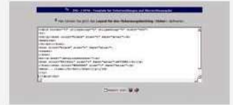
-Screenshot Administration- Layout and content are determined by input box.

Your changes are visible as fastas you require!